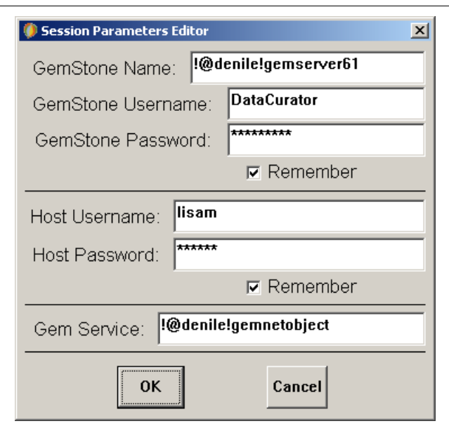
Figure 1.2 The Session Parameters Editor

Select the Add button to add a set of session parameters. A Session Parameters Editor dialog opens, prompting you for the session parameters (Figure 1.2).