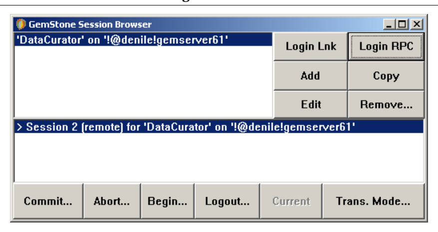
Figure 1.4 The Session Browser After Login

10. Successfully logging in to GemStone verifies that your GBS installation is complete. To end the session, click Logout . If you wish to save your session parameters, save your Smalltalk image when you exit.