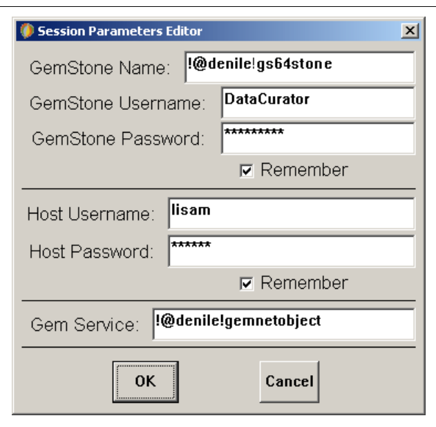
Figure 2 The Session Parameters Editor

5. Select the Add button to add a set of session parameters. A Session Parameters Editor dialog opens, prompting you for the session parameters (Figure 2).