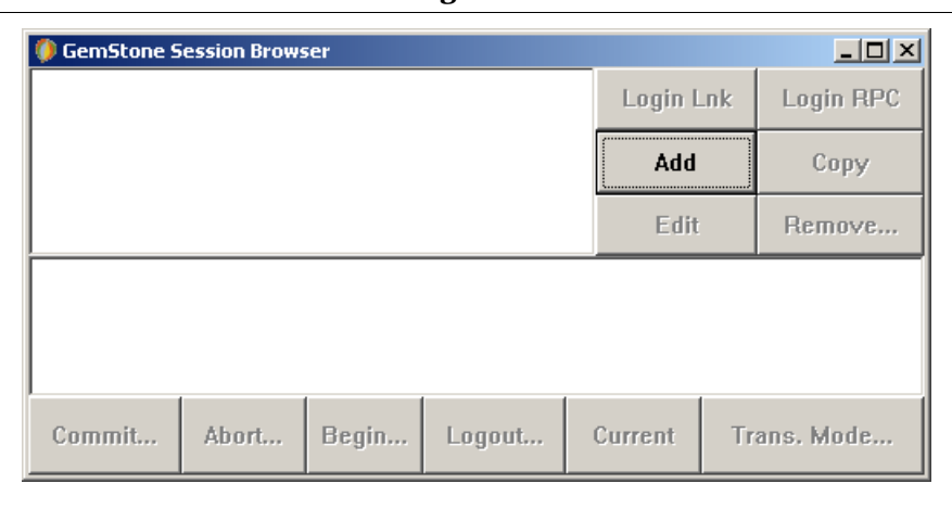
Figure 1 The Session Browser Before Adding a Session

5. Select the Add button to add a set of session parameters. A Session Parameters Editor dialog opens, prompting you for the session parameters (Figure 2).