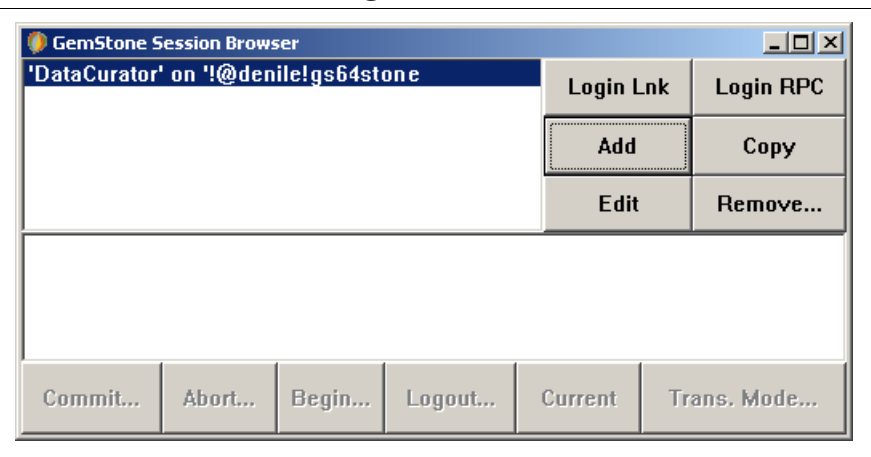
Figure 3 The Session Browser Before Login

7. In the Session Browser, select the newly-defined session parameters (Figure 3) and click on Login RPC to log in to GemStone.